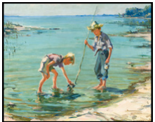
Manly MacDonald Permanent Collection Favourites On display in Gallery 3 and in our Corridor Cabinets