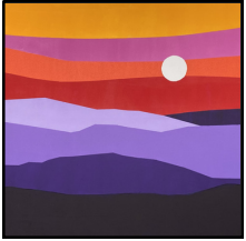
BOLD VISION Paintings by Dayna Law On display in Gallery 1 until August 30