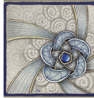
The Doodle Group Guided workshop. Bring your own materials. Free to attend Friday, August 1: 10:30 a.m. - 12:30 p.m.