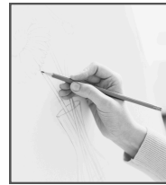
Life Drawing Workshop Nude Model Non-instructional drawing session Registration Required. 18+ $5 suggested donation Wednesday, August 27: 5:30 - 7:30 p.m.