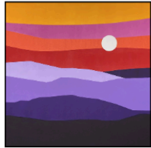
BOLD VISION Paintings by Dayna Law On display in Gallery 1 until August 30