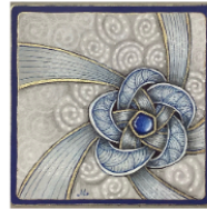
The Doodle Group Guided workshop. Bring your own materials. Free to attend Friday, August 1: 10:30 a.m. - 12:30 p.m.