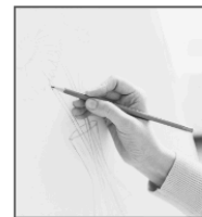
Life Drawing Workshop Nude Model Non-instructional drawing session Registration Required. 18+ $5 suggested donation Wednesday, August 27: 5:30 - 7:30 p.m.