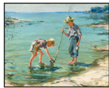
Manly MacDonald Permanent Collection Favourites On display in Gallery 3 and in our Corridor Cabinets